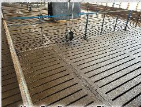
Hog Confinement Floors