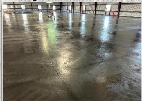
Machine Shop / Warehouse Floors